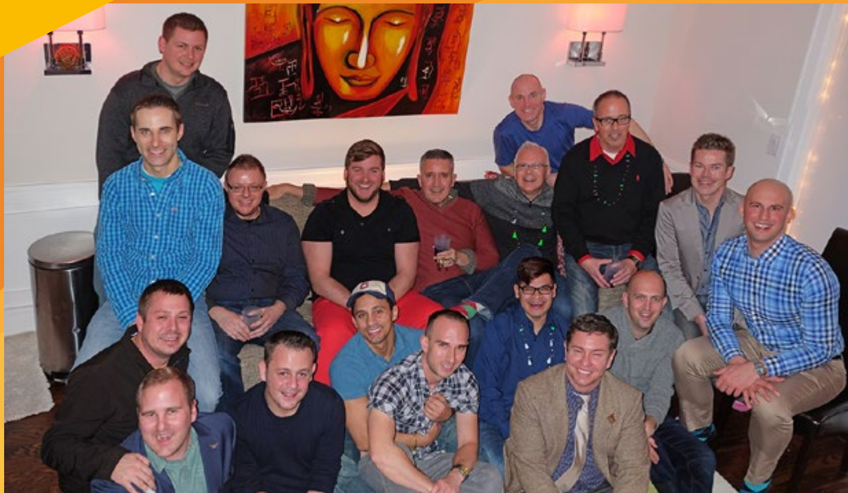
WINDY CITY FLYERS, CHICAGO